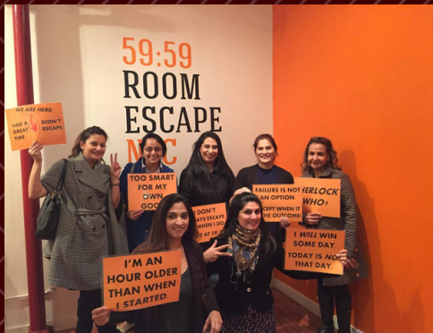
We weren't able to escape the room, but we sure did have a lot of fun :)