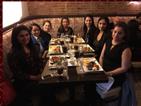
Later enjoyed a lovely dinner at Ravagh Persian Grill